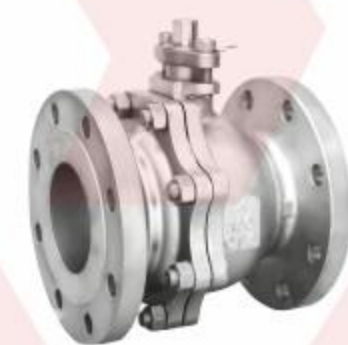
美标球阀 American Standard Ball Valve