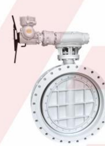
电动法兰蝶阀 Electric Flange Butterfly Valve