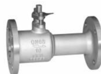
一体式高温球阀 One-piece high temperature ball valve