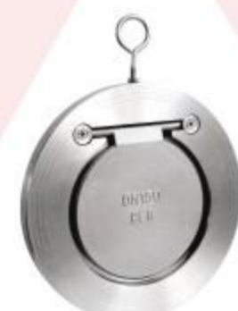
H74对夹圆片止回阀 H74 Wafer Check Valve