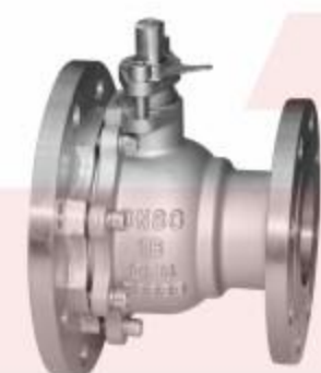
放料球阀 Feeding the ball valve