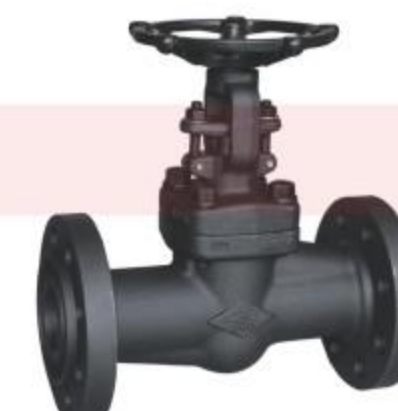
锻钢闸阀 Forged Steel Gate Valve