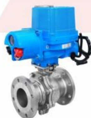
电动球阀 Electric ball valve