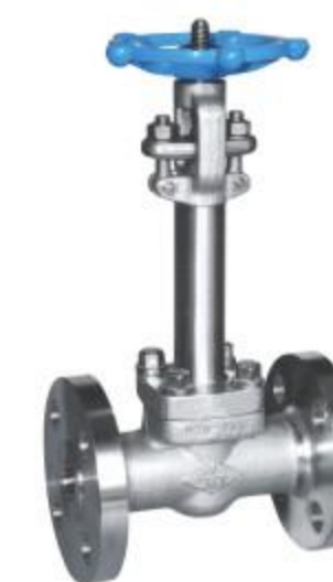
锻钢低温闸门 Forged Steel Low Temperature Gate