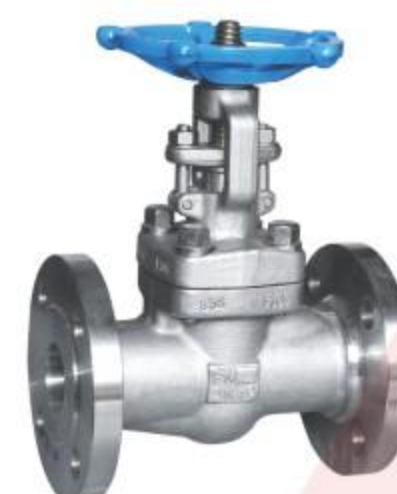
不锈钢锻钢闸阀 Stainless Steel Forged Gate Valve