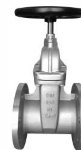
软密封闸阀 Soft seal gate valve