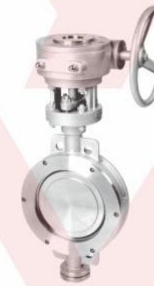
不锈钢对夹蝶阀 Stainless Steel Wafer Butterfly Valve