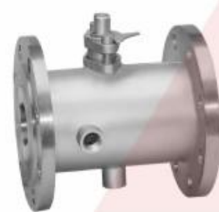
保温球阀 Insulation ball valve