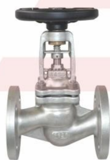
波纹管截止阀 Bellows globe valve