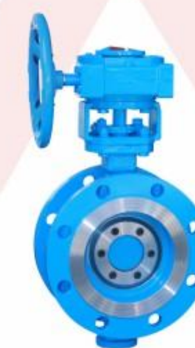
铸钢法兰蝶阀 Cast Steel Flange Butterfly Valve