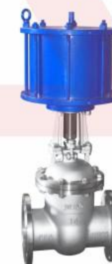
气动闸阀 Pneumatic valve