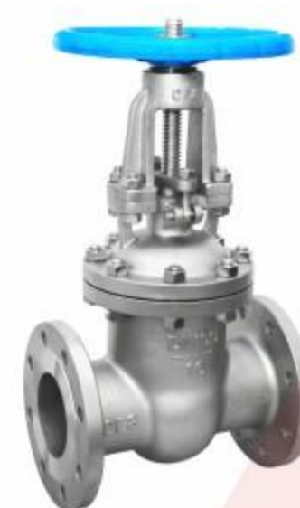
国标闸阀 National standard gate valves