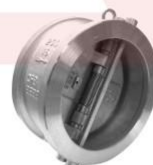
H76对夹双瓣止回阀 H76 Wafer Double Check Valve