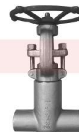
锻钢自密封高压截止阀 Forged Steel Self-sealing High Pressure Globe Valve