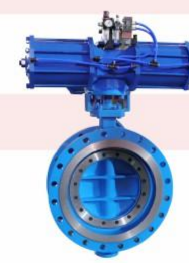
气动铸钢法兰蝶阀 Pneumatic Cast Steel Flange Butterfly Valve