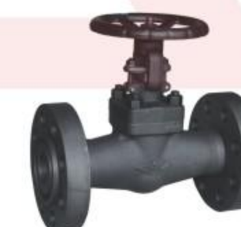
锻钢截止阀 Forged Steel Globe Valve