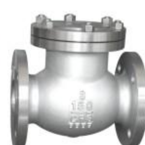
H44美标法兰止回阀 H44 American Standard Flange Check Valve