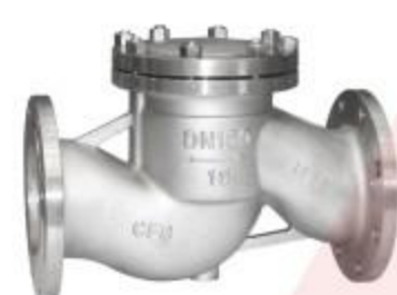
H41升降式法兰止回阀 H41 Lifting Flange Check Valve