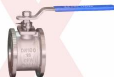
对夹薄型球阀 Wafer thin ball valve