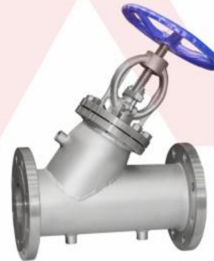
保温截止阀 Insulation cut-off valve