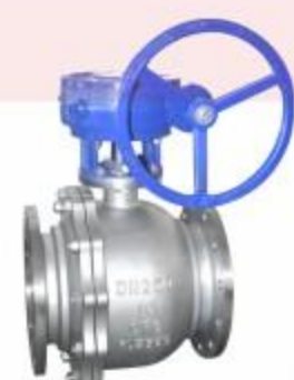
涡轮浮动球阀 Turbine floating ball valve