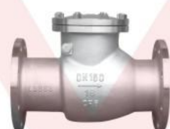
H44旋启式法兰止回阀 H44 Swing Flange Check Valve