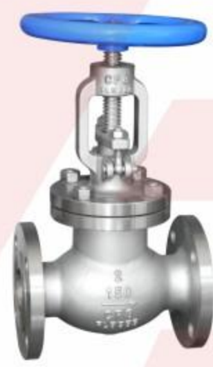
美标截止阀 American standard cut-off valve