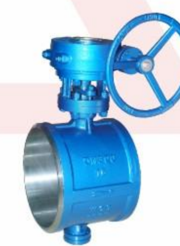
铸钢焊接蝶阀 Cast steel welded butterfly valve