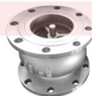
HC41消声法兰止回阀 Hc41 Silence Flange Check Valve