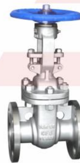
日标闸阀 Japanese standard gate valves