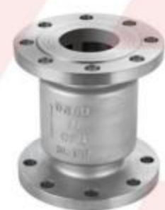
H42立式法兰止回阀 H42 Vertical Flange Check Valve