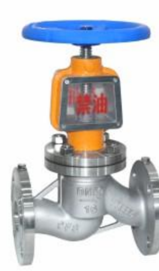
氧气截止阀 The oxygen valve