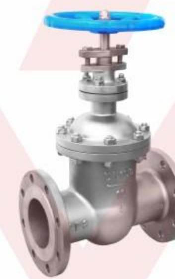
暗杆闸阀 Non-rising stem gate