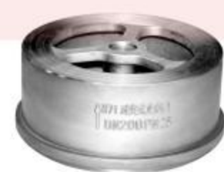
H71对夹升降式止回阀 H71 Wafer Lifting Check Valve