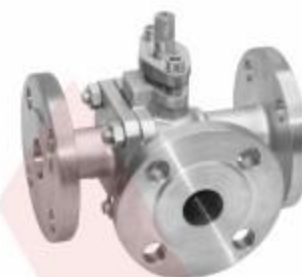
三通球阀 The 3-way ball valve