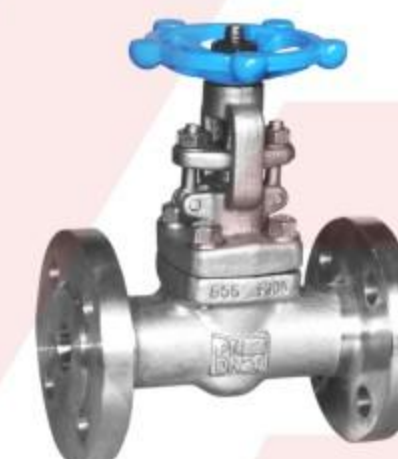
不锈钢锻钢闸阀 Stainless Steel Forged Gate Valve