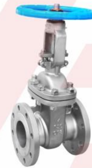
美标闸阀150LB American Standard Gate Valve 150LB