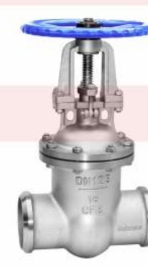
焊接闸阀 Welding gate valves