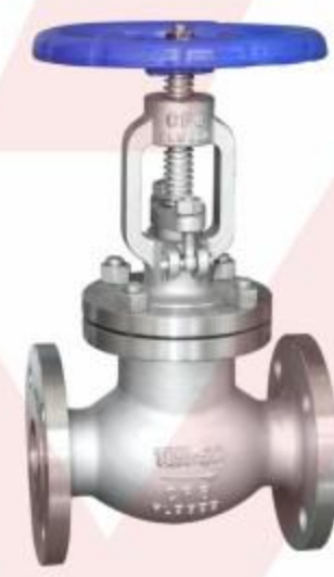
日标截止阀 Japanese standard globe valve