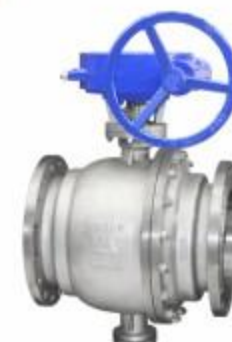
涡轮固定球阀 Turbine fixed ball valve