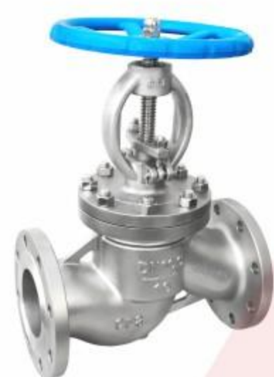
国标截止阀 National standard globe valve