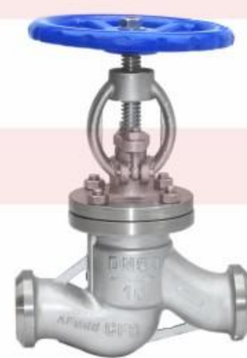
焊接截止阀 Welding stop valve