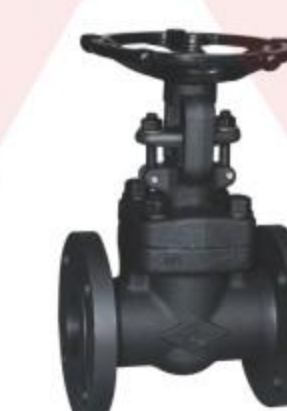
美标锻钢闸阀 American Standard Forged Steel Gate Valve