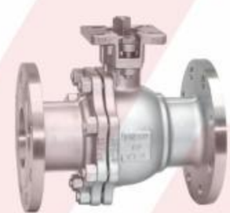
高平台球阀 High platform ball valve