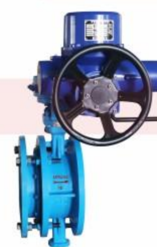
电动伸缩蝶阀 Electric Telescopic Butterfly Valve