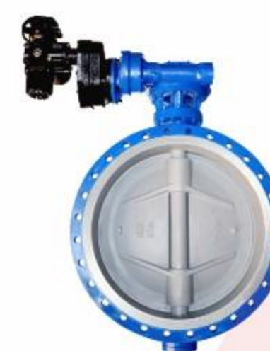
电动法兰蝶阀 Electric Flange Butterfly Valve