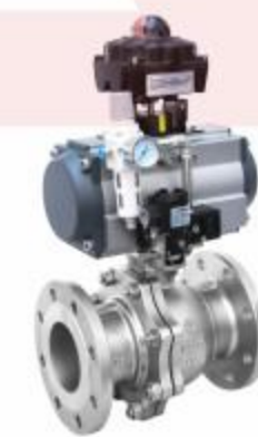
气动球阀 Pneumatic ball valve