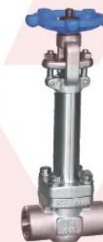
锻钢低温闸门 Forged Steel Low Temperature Gate