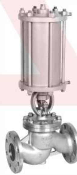
气动截止阀 Pneumatic globe valve