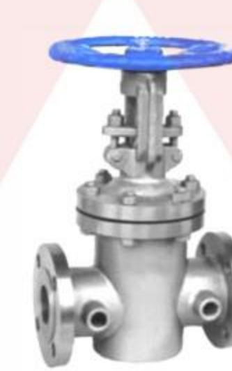
保温闸阀 Insulated gate valves