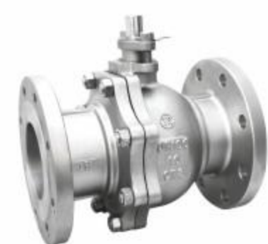
国标法兰球阀 GB Flange ball valve